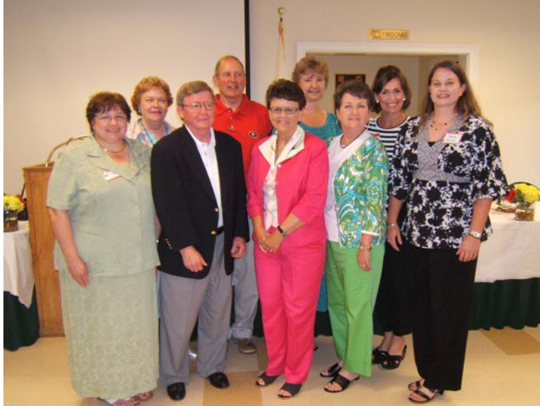
2008 Georgia Master 4-H Club Officers and Directors pose for a picture at the annual meeting and banquet